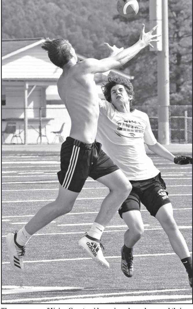
The young crop of Union County wide receivers have showcased their pass-catching skills all summer.

"It's not going to be easy this year," he said. "You're going to have to put in a lot of extra work. If they want to be one of the best teams to come offensive lineman took the through Union County, which field. Much like the receivers, they have the potential to be,